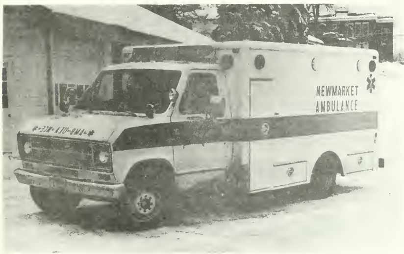
New 1976 Ford Classic Modulance Vehicle